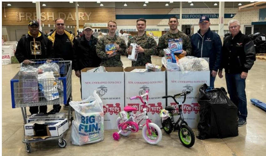
Unloading the toys at the collection center.

Fantastic effort, Route 66 Corvette Club!