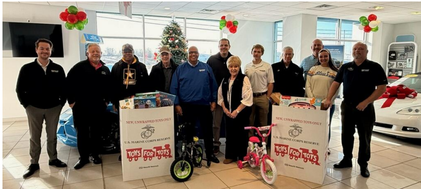
Rt66CC picking up toys donated at Poage Chevrolet in Wentzville